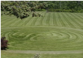
Stella Niagara's Labyrinth